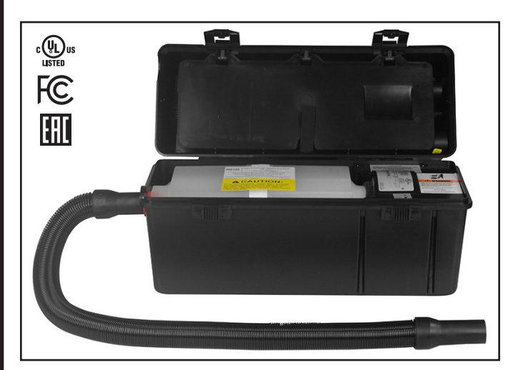
Figure 1. SCS 497 Electronic Service Vacuum