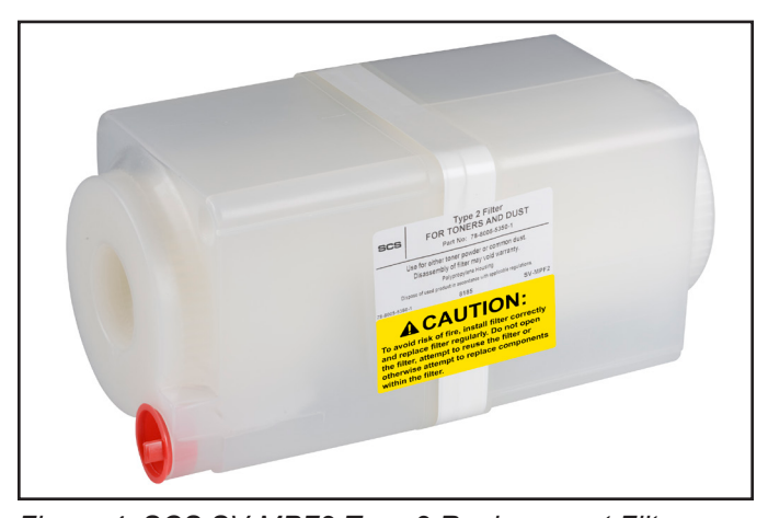
Figure 4. SCS SV-MPF2 Type 2 Replacement Filter