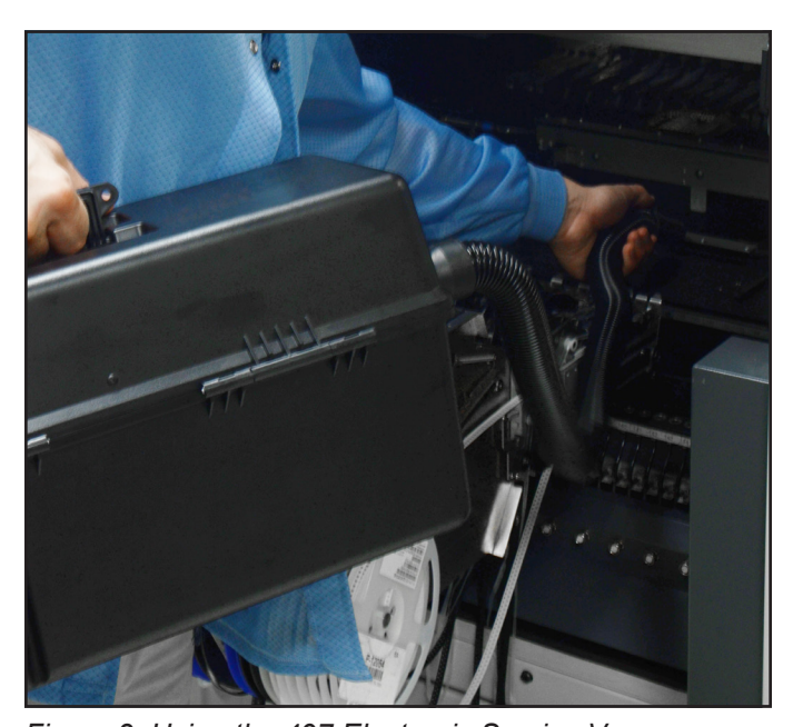
Figure 3. Using the 497 Electronic Service Vacuum

Use the power switch to power the vacuum ON. Use the carrying handle or SV-CS1 carrying strap to carry and transport the vacuum.